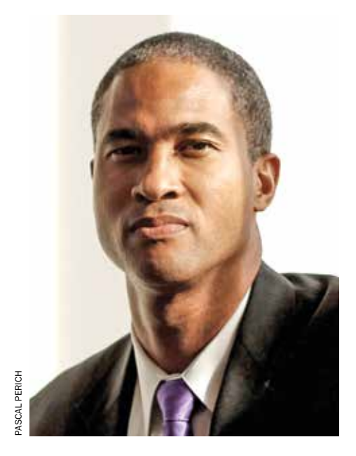
'Somehow, we've forgotten that trade, capital flows and immigration are the keys to driving greater shared prosperity — whether you're in Akron, Ohio, or Accra, Ghana. We need more of those things, not less.'