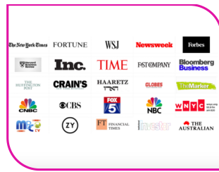
A sample of my media coverage