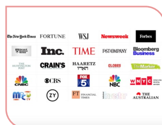
A sample of my media covera...