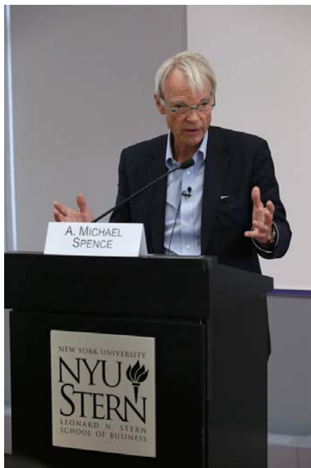
A. Michael Spence, Keynote Speaker

In addition to its scale (in terms of population, output and exports), China stands out economically in notable ways. In particular, consumption accounts for an exceptionally low share of expenditure – only about 35 percent of GDP, compared to advanced economy norms in the