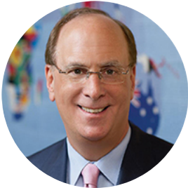
Larry Fink Chairman and Chief Executive Officer